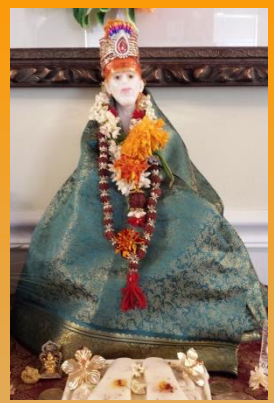
SAI Kuteer is located at 834 E 9400 S, Suite # 63, Sandy, UT 84094. For directions/location map visit www.saikuteer.org